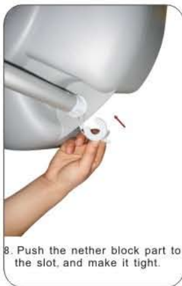
8. Push the nether block part to the slot, and make it tight.