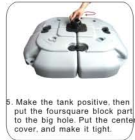
5. Make the tank positive, then put the foursquare block part to the big hole. Put the center cover, and make it tight.