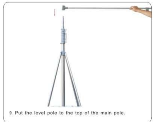
9. Put the level pole to the top of the main pole.