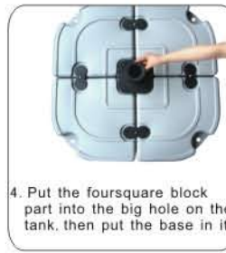
4. Put the foursquare block part into the big hole on the tank, then put the base in it.