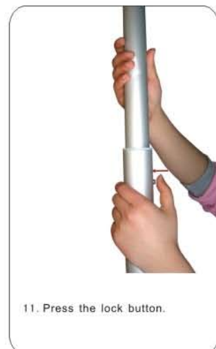
11. Press the lock button.