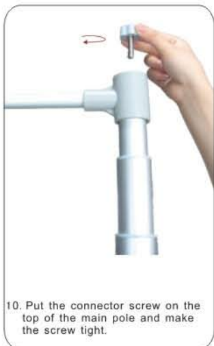
10. Put the connector screw on the top of the main pole and make the screw tight.