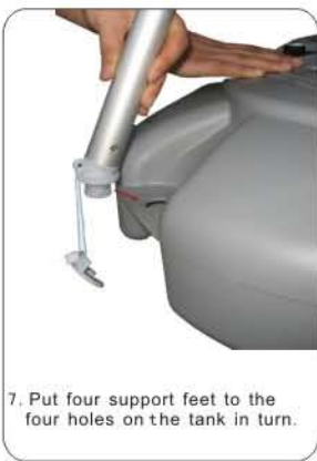
7. Put four support feet to the four holes on the tank in turn.