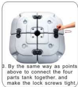
3. By the same way as points above to connect the four parts tank together, and make the lock screws tight.