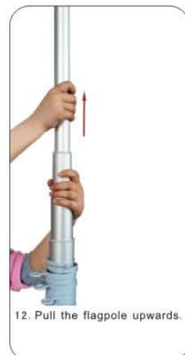
12. Pull the flagpole upwards.