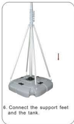
6. Connect the support feet and the tank.