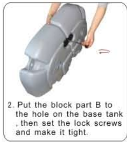
2. Put the block part B to the hole on the base tank, then set the lock screws and make it tight.